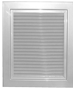
1300A1 Photo & Drawing

Inverted "V" With 60% Free Area Recommended for Buildings Where All-Aluminum Construction is Desired, or for Humid Environments