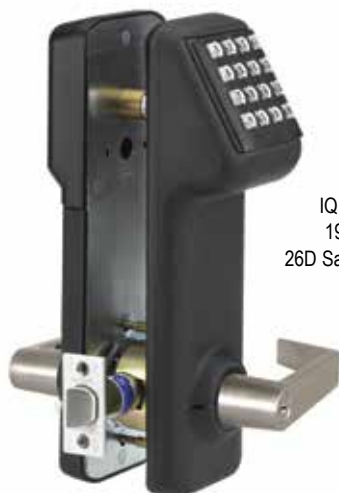
IQ1LITE Cylindrical Model Shown; 19 Black Powder Coat finish with 26D Satin Chrome Plated American Levers