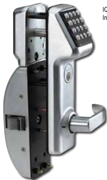
IQ7DATA/26D Rim Exit Device Interface Model Shown