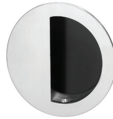
Rockwood RM785 Flush Pull