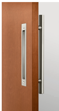
Rockwood RM790 Flush and Post Mount Pull Combo