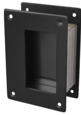
Rockwood 94BTB Flush Pull

For additional Rockwood pulls, see the catalog or click here .