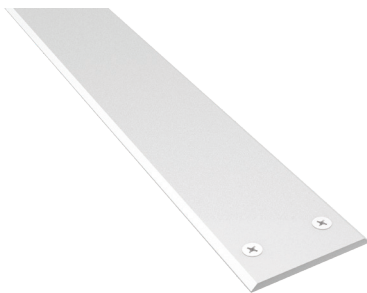
Pemko 18/1A Mill Aluminum Bottom Track 1/8" thick aluminum sheet for use in carpeted applications