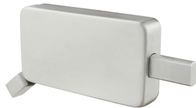
Pemko SDL Sliding Door Lock Supplied with Hide Slide™ kit.